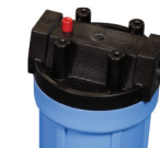
Pressure release button