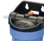
3G head with QC fittings