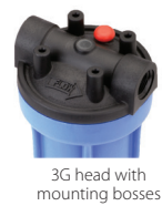
3G head with mounting bosses