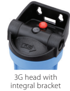
3G head with integral bracket